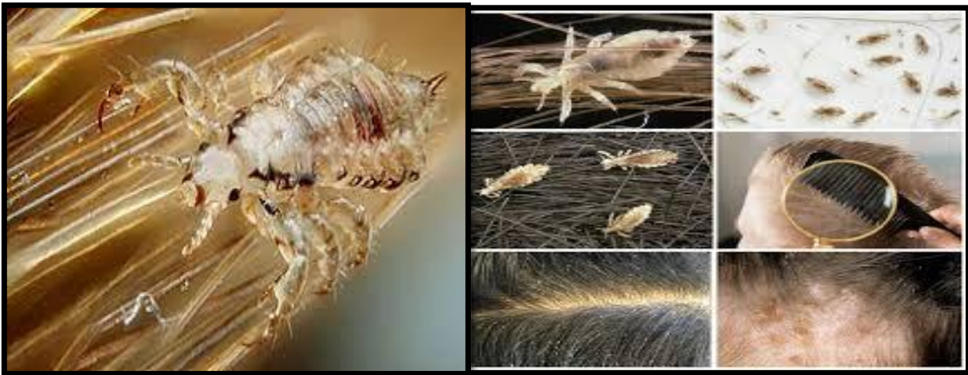
Figure (1) : explain head lice (2)

Head lice contamination is one of the most common parasitic contaminations in the world that causes serious health problems for many communities, especially for school children (9) . It may also have psychological and social outcomes. This condition may lead to the students' educational failure (10) . Head lice contamination is common worldwide and has been proposed as a major health problem not only in poor countries but also in developed and industrial countries. Every year, over 12 million Americans are contaminated by this parasite (11) . Studies carried out in different parts of the world have reported different prevalence for head lice in children. The rate of contamination has been estimated to be 16.59% in India, 13.3% in Yemen and 8.9% in Belgium. Various reports have been published on the percentage of contamination in Iran. For instance, it has been reported to be 0.47% in Aran and Bidgol, 2.2% in Babol, 4.5% in Gilan, 6.7% in Hamedan, 7.7% in Sanandaj, and 13.3% in Qom (12) . The aims of study to estimate the updated pediculosis capitis (head lice infestation) prevalence among school girls and its associated factors in Thi-Qar province.