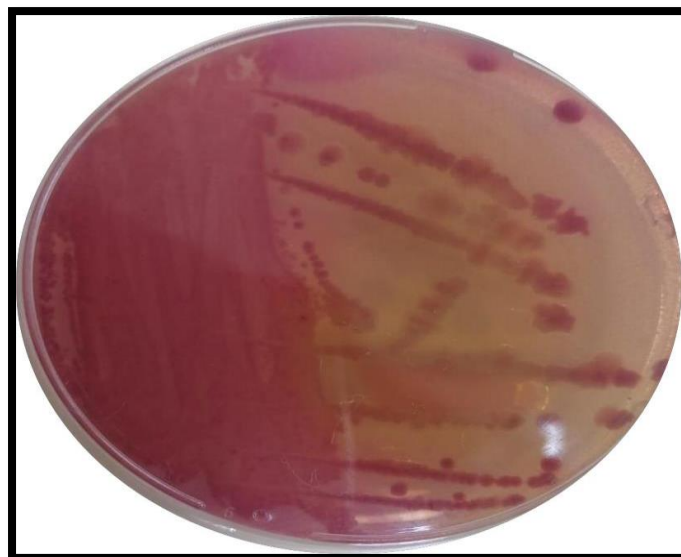
Figure 1. Escherichia coli on MacConkey agar.

During the current study 35 kinds of antibiotic disks were used and categorized into 13 antibiotic kinds belonging to Beta-lactams [Amoxicillin/Clavulanic Acid ( Penicillin G, Oxacillin, Ampicillin,