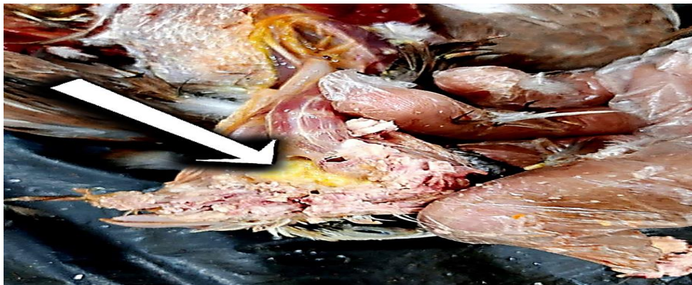
Figure (1): domestic pigeon infected with T.gallinae shows caseous material white to yellowish in color in the oropharyngeal cavity (white arrow).